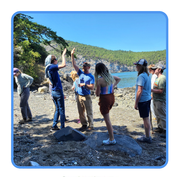
CONSERVATION D I S T R I C T

Fee for full-time residents: Free Fee for non-residents: $65